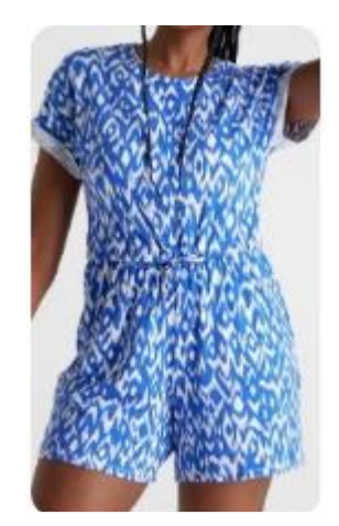
Please note the below applies to all visitors, regardless of age or gender.

No ripped jeans, ripped shorts, ripped leggings, or ripped trousers.